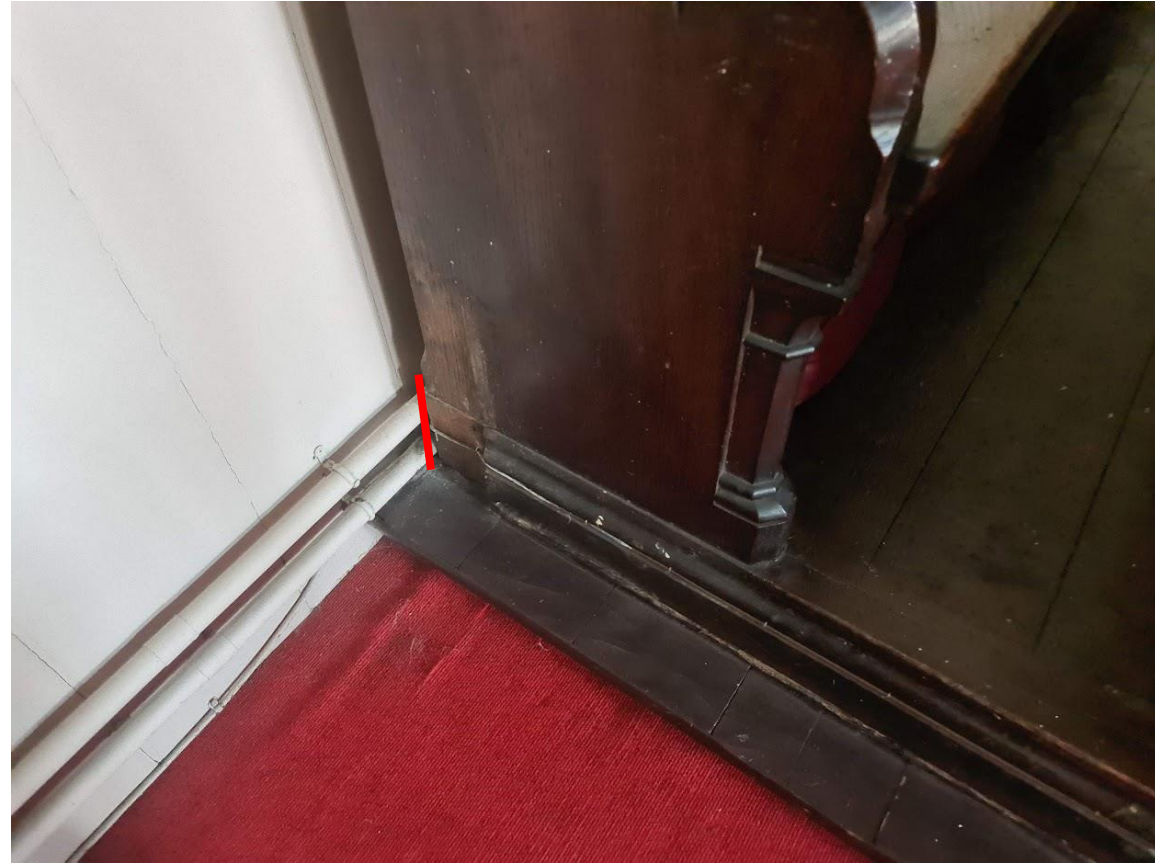
THE CABLE DROPS IN TO THE GAP BETWEEN THE FLOOR BOARDS AND THE WALL WITH EXISTING CABLES