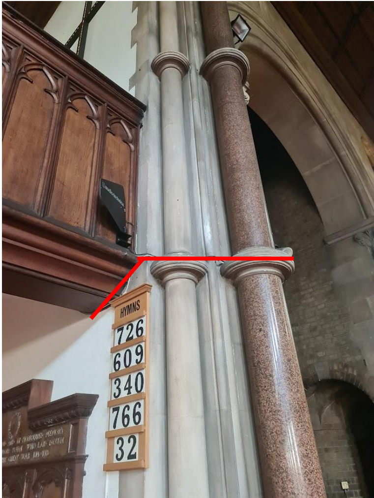
CABLE FOLLOWS DETAIL IN THE CORNER AND EXISTING CABLES FOR MOST THE RUN